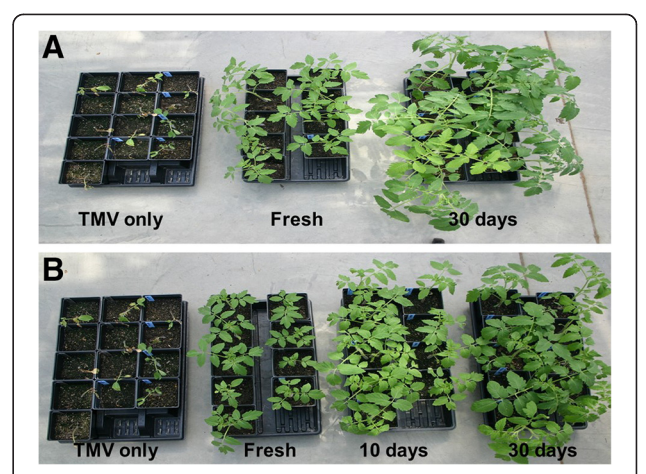
Figure 3 Stability of prepared disinfectants in prolong storage for their effect in deactivating Tobacco mosaic virus (TMV) infectivity. A). Comparative effectiveness of freshly prepared 10% Clorox® bleach solution (Fresh) and a similarly prepared solution in storage at room temperature (20–30°C) for 30 days. The positive control (TMV only) without treatment was used to assess the TMV infectivity in the inoculum. B). Comparative effectiveness of 2% Virkon S solutions from a freshly prepared (Fresh), those in storage for 10 days (10 days) and 30 days (30 days) after preparation at room temperature (20–30°C). A positive control (TMV only) was used to assess TMV infectivity in the inoculum.

prepared solution or those solutions in storage for 10 days and 30 days were fully protected from TMV infection (Figure 3B).