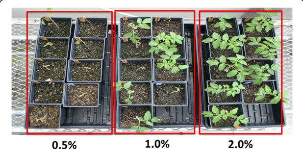
Figure 2 Effects of various concentrations of Virkon S in deactivating Tobacco mosaic virus (TMV) infectivity as assessed in bioassays through rub-inoculation upon exposure for 30 sec using Virkon S at 0.5% (left) with no protection, at 1% (middle) with partial protection, and at 2% (right) with full protection.

To address concerns over the stability of disinfectants in prolong storage, the two most effective disinfectants (10% Clorox regular bleach and 2% Virkon S) were examined against TMV infection. Each treatment was performed through mixing an equal volume of TMV inoculum with a 2X stock solution of a respective disinfectant. In the case of Clorox regular bleach, the 2X stock solution (20% Clorox regular bleach) was stored at room temperature (20-30°C) for 30 days. Virkon S, 4% stock solution (2X) was prepared and stored for two time periods, 10 days and 30 days. At each storage time point, treatments were carried out by mixing an equal volume of a prepared virus inoculum with a 2X stock solution for 30 seconds just before used for a bioassay. Results showed that in comparison to that of a freshly prepared solution, the ability to deactivate TMV infectivity of Clorox regular bleach in storage for over 30 days was equally effective (Figure 3A). Virkon S, stock solutions (2X) in storage for 10 days or 30 days were equally effective to deactivate TMV infectivity in comparison to those of a freshly prepared solution. While all the test plants in the positive control without treatment were severely infected and dying, plants treated with a freshly